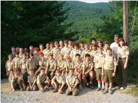
Troop 650 at Camp Ottari, VA

The boys are in charge with guidance and support from the Adult leaders.