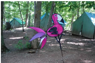
2007 summer camp

http://troop650bsa.org/Troop650calendar.htm